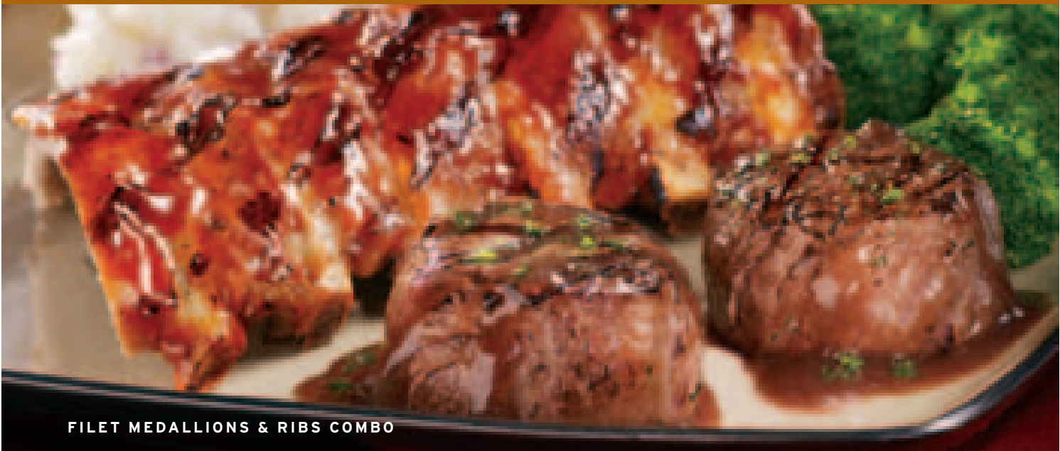
FILET MEDALLIONS & RIBS COMBO

THIS IS THE STUFF THAT LEGENDS ARE MADE OF. The finest pork and beef ribs, richly seasoned with select spices, slow-smoked to mouthwatering perfection. Basted with your choice of one of our Signature Sauces: Original, Carolina Honeys™, Blue Ridge Smokies™, Maker's Mark® Bourbon BBQ or Tony Roma's Red Hots™.