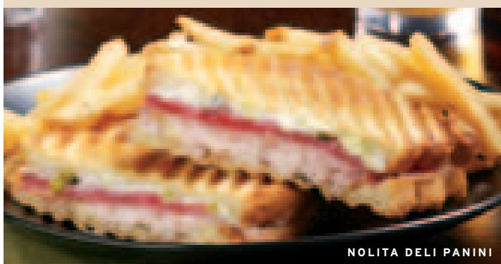
NOLITA DELI PANINI

Each sandwich is served with French fries and a pickle. Add a cup of soup or dinner salad for just 1.99.