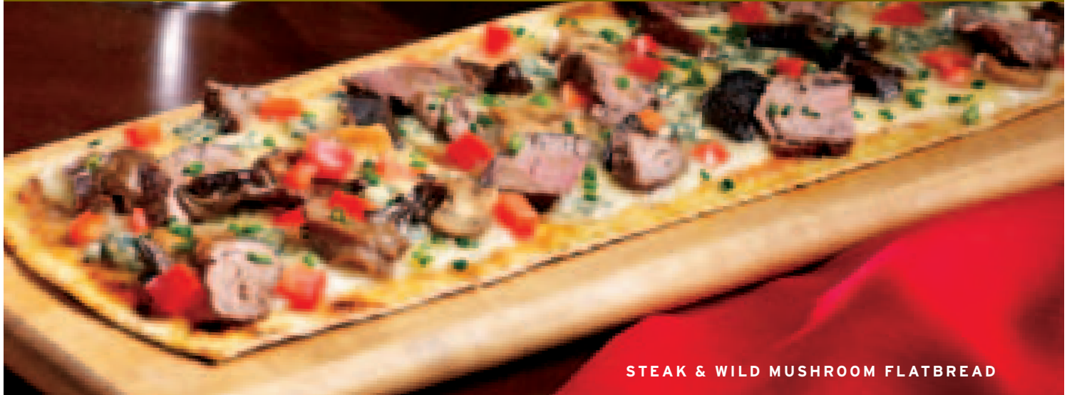
STEAK & WILD MUSHROOM FLATBREAD

But the Tony Roma's story does not end with ribs. Crisp, fresh salads, mouth watering char-grilled steaks, and delicious, custom-topped seafood make up a menu that is sure to please.