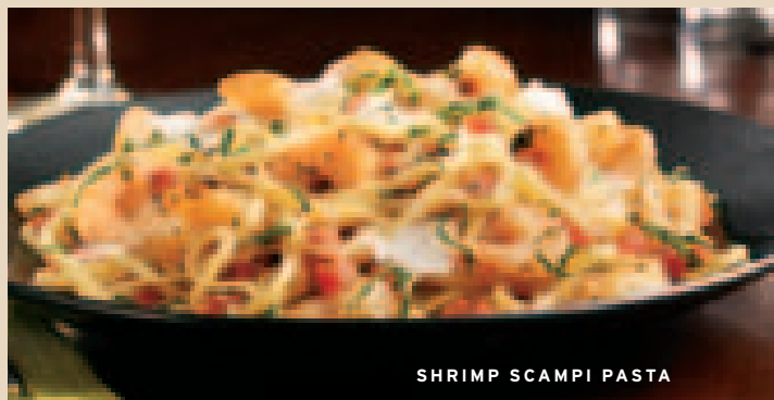
SHRIMP SCAMPI PASTA

Tender grilled chicken breast and linguine, nestled in a savory sauce of artichokes, butter and capers. Garnished with tomato pesto salad, Asiago cheese and fresh chopped parsley. 12.99