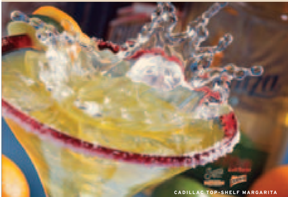
CADILLAC TOP-SHELF MARGARITA