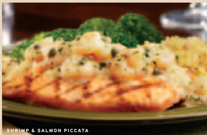
SHRIMP & SALMON PICCATA

Seasoned Mahi Mahi basted with Tony's exclusive citrus and brown mustard Mojo sauce and grilled to perfection. Topped with pineapple salsa made in-house and served with rice pilaf and a fresh vegetable. 16.99