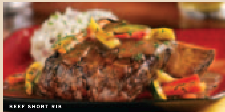
BEEF SHORT RIB

BBQ Chicken 15.99 South Miami Fried Shrimp 16.99 Grilled Gulf Shrimp Skewers 16.99 Grilled Salmon 17.99 Sirloin 21.99