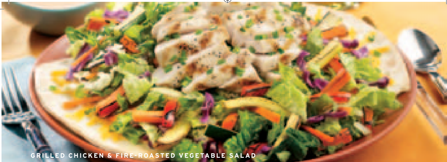
GRILLED CHICKEN & FIRE-ROASTED VEGETABLE SALAD